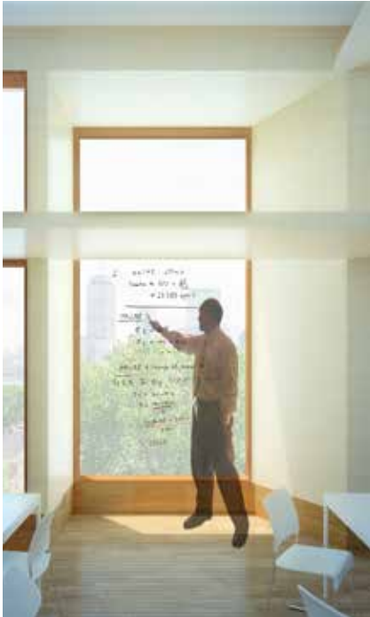
▲ The interior of the 'world window' provides for small-scale learning

A new school in the heart of Roxbury will be among the first purpose-built STEM schools in the nation